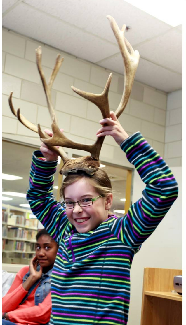
Revelstoke Caribou Rearing in the Wild Society